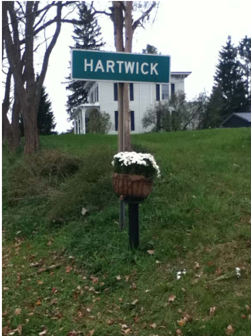
Above: Entrance to village on North Street

Civic character is distinct in that it stresses public investment, through either governmental or other organizational means, in the physical structure. It contrasts with other forms of character, such as economic or residential character, by this group level involvement. Economic character should be understood as the status of business traditions at one point in time, and is reflected in many metropolitan areas, for example, by a shift from downtown retail development to that found in shopping centers and malls. Residential character refers to the status of housing in a community. Indeed, both reflect decisions made at the individual level and any community impacts are the result of emergent characteristics; civic character is most often a planned community impact. Civic character is the result of historical processes manifest in one time and place, and thus becomes the impetus for action in the future.