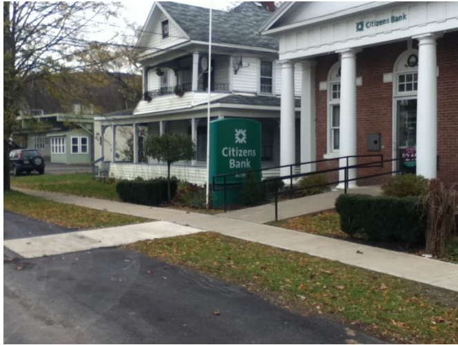
Above: Main Street

Hartwick is an unincorporated village of 629 residents within the Town of Hartwick, and is the largest urbanized area within a predominantly rural township of 2,110 residents (Census Bureau, 2013). The town population has fluctuated wildly over its history, from a peak of just over 2,700 residents in 1830 to only 1,400 people in 1960 (see figure 1). Much of this decline occurred during a twenty year period between 1880 and 1900 as local youth migrated to the Mohawk Valley in search of employment in the city of Utica and its nearest suburbs (Thomas 2005). The decline in population meant that the physical structure of the village was established very early, and between 1830 and 1960 relatively little new construction took place (although some new residential streets were added after the arrival of the railroad in 1900). Not surprisingly, the village is rich in structures dating to the nineteenth and early twentieth centuries, but their level of upkeep is uneven. The character of the village today thus reflects a period of stagnation and even decline over about 130 years