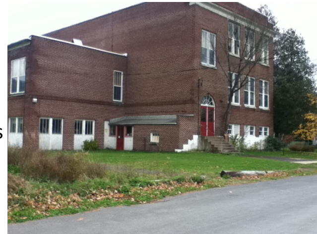
Above: Side facing street

In both cases external forces were partially responsible for the era's contribution to the civic character. The expectations in both the 1890s and the 1920s were massaged by cultural concerns about what a little city required: a modern cemetery and a modern school. By the 1920s, however, the loss of population (tax base) combined with escalating (urbancentric) expectations meant the village could not afford to keep up with modern expectations. The aspect of the village's civic character that was to be most impacted by external forces, however, was its streetscape.