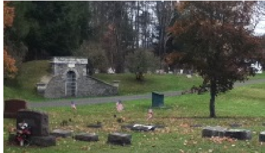
Above: The cemetery

The local cultural concern that the village have the same amenities as any other urbanized setting was apparent in a number of early projects that contribute to the character of the village today. The residential character was established along urban schema from an early stage in the village's history, and houses are of course still relatively close to each other and set to a common setback along the streetscape. During the 1890s, the cemetery was constructed in its present form in a manner inspired by the "City Beautiful" movement (Thomas 2013). Villagers formed the Hartwick Cemetery Association to purchase the fairgrounds next to the original cemetery, laid out a road system, and completed it with a new vault and terraced gardens. Now paved, the cemetery is still used as a park as it is good for bicycling, walking, and other such sports.