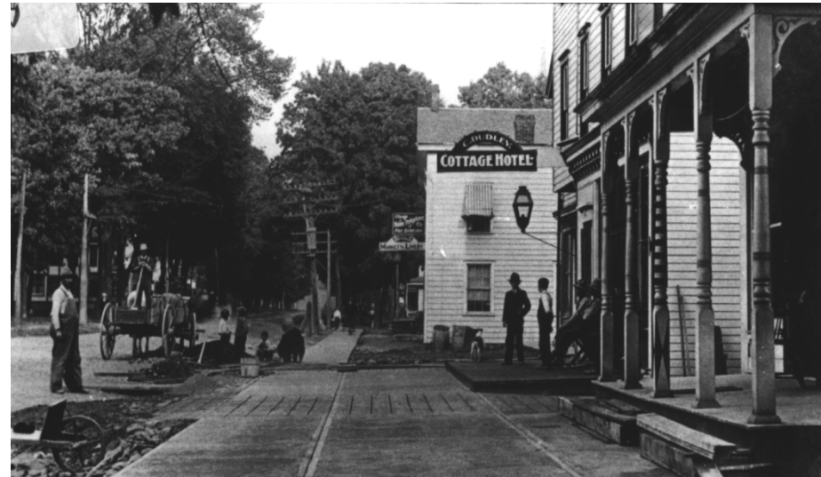
Below: Workers installing concrete sidewalk ca. 1900

The attitude of most villagers during the nineteenth century was that villages were “urban” centers: villages were not “small towns” but rather “small cities.” Even the smallest villages attempted to “keep up” with the advances and fashions found in much larger cities, and in Hartwick this included such basic amenities as paved streets, concrete sidewalks, and a modern water system. As the largest cities grew to immense size this perception of small towns as “little cities” was gradually replaced by an anti-urban sensibility, but even as late as the early twentieth century many small towns were modeled on urban sensibilities. In Hartwick, this translated into a continued desire for “modern” amenities, and the criticisms of the village were often pale reminders of urban criticisms.