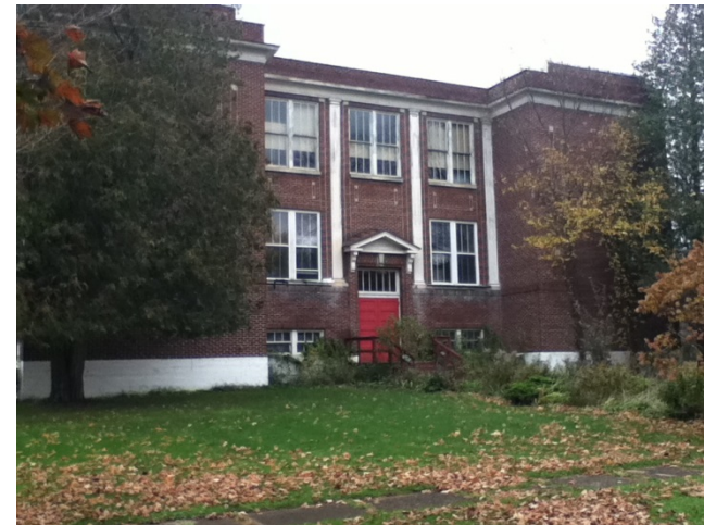
Below: Front not facing street