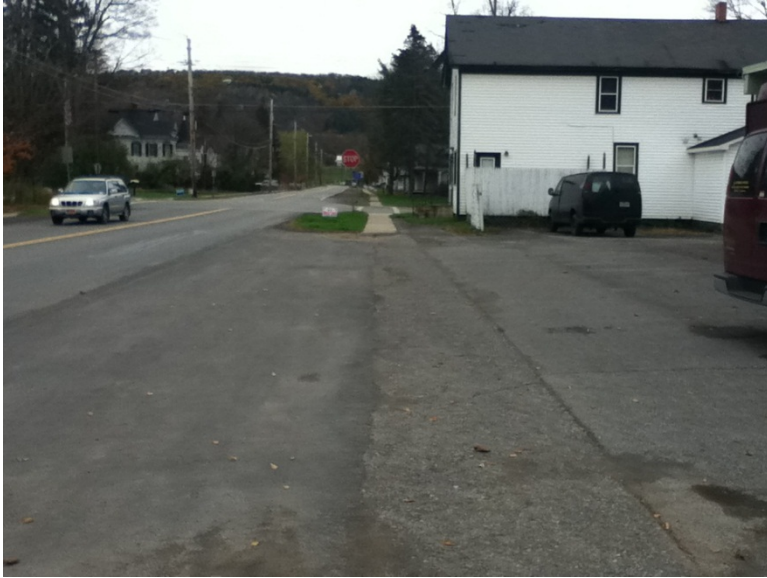
Main Street, today and in the past