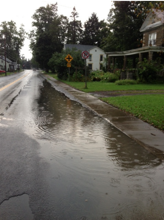
NY 205 after a moderate rain

It was not just the county-owned Main Street that faced aesthetic issues. The state highway, formerly known as North and South Streets, has had no significant repairs except for occasional resurfacing in decades. The town-owned sidewalks are uneven, with one side of the street having received brand new sidewalks during a water system project in 2009 but the other side of the street making due with the asphalt sidewalks last paved during the 1980s. A blue directional sign erected by the state for which local businesses can buy advertisements sits half empty at the intersection with Main Street, yet a more functional sign directing drivers to nearby communities is not found in the village. The streets have no curbs and poor drainage, the new sidewalks flanked with a strip of asphalt between the street and concrete walks. The local government has asked for some assistance from the state, including a lower speed limit and a sign to direct local tourists to Cooperstown, but to little effect.